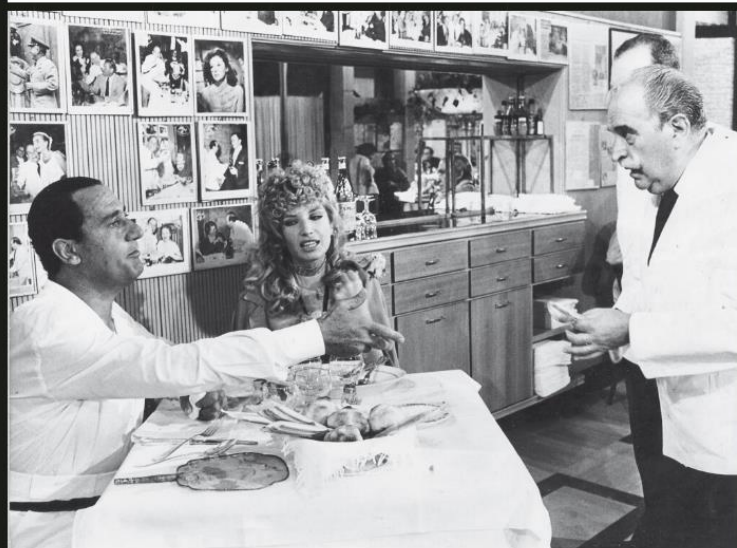
ALBERTO SORDI E MONICA VITTI